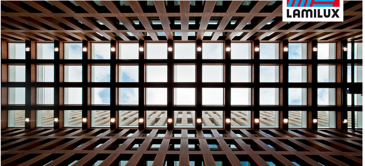
Library at Humboldt University, Berlin